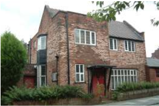
8 Arkholme (1901), 1 Towncroft Avenue