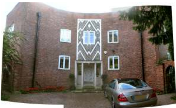
Early Modernism - Royd House, Hale, Cheshire 1914

At the height of his fame, Wood worked with J. Henry Sellers and created a series of radical new buildings of a type unseen before. With their flat reinforced concrete roofs and sometimes geometric patterns, they were among the first examples of "modern architecture" in Europe.