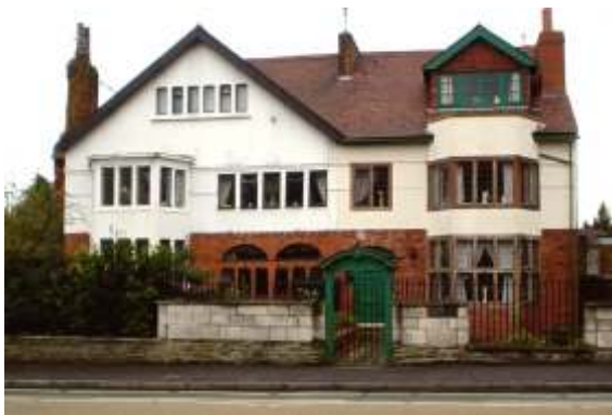
6 Fencegate & Redcroft (1895)

Two of these romantic "white" buildings can be found in Middleton town centre, a pair of semidetached houses, Fencegate & Redcroft [6] (1895) and a shop and seven houses, 34 to 48 Rochdale Road (1898) [10] opposite.