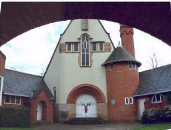
Art Nouveau - First Church of Christ Scientist, Manchester 1903