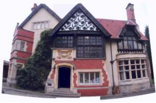
Arts & Crafts Romance - Halecroft, Hale, Cheshire 1890