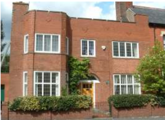
5 36 Mellalieu Street (1906)

The very first example was a photographic studio, Arkholme , for Charles, brother of Fred Jackson [8]. This is angular, plain and something of a transistional design. The austere character was new, as were the two flat reinforced concrete roofs. Nevertheless, being 1901, the building still has the expressive character of the previous phase.